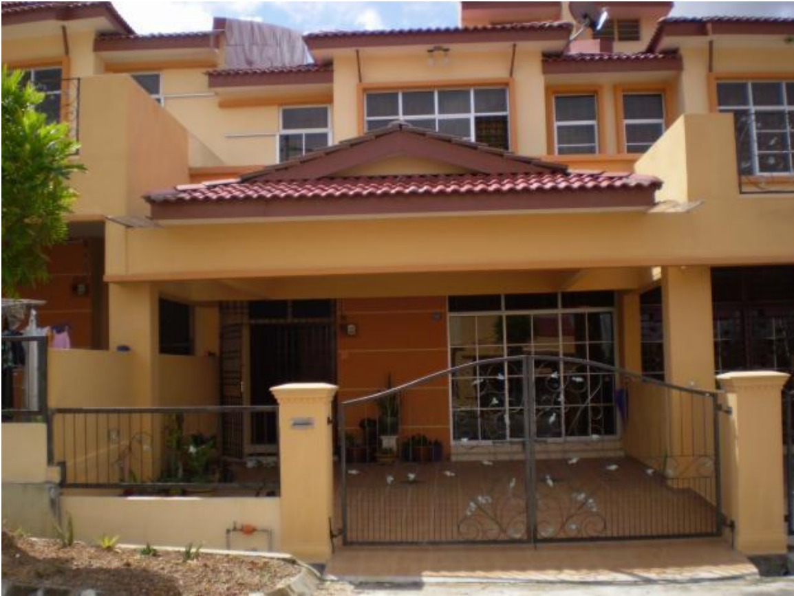
A picture of rumah teres

We have also looked at modern houses- Rumah Moden.